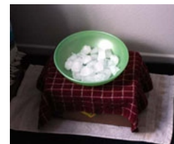
Ice on top keeps the box cool