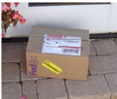
Arrival the day before

However, during hot weather seasons, a little extra cooling can help. Placing a towel and a plastic bowl of ice over the box works very well. Don't worry -- the cool and darkness are their preferred conditions for resting.