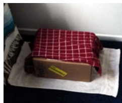
A towel provides shade and absorbs condensation